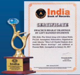
India Book of Records Swachh Bharat Drawings by Left Handed Students