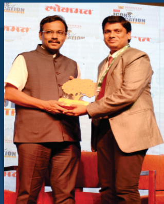
State Level Award By the Hands of : Hon. Vinod Tavde (Education Minister, Govt. of Maharashtra)