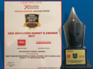
Best Innovative International School with Excellent Faculty in Maharashtra 2017