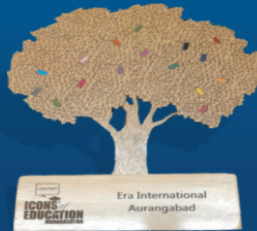
Icons of Education Maharashtra