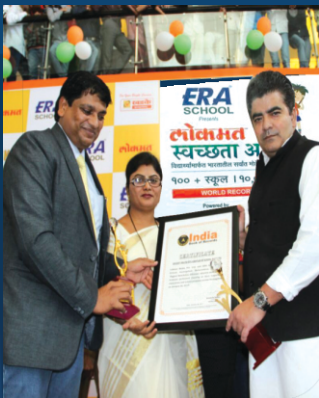
International Level Award By the Hands of : Record Date 26 January 2017