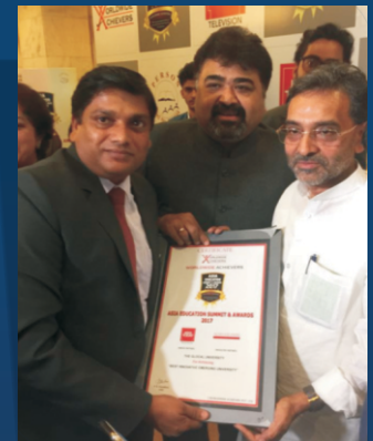
National Level Award By the Hands of : Shri. Upendra Kushwaha Minister of State of Human Resource Development, (Govt. of India) Smt. Sharmilla Tagore