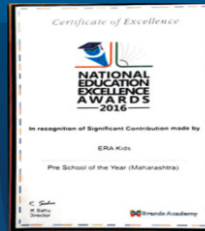
Pre School of the Year Maharashtra 2016