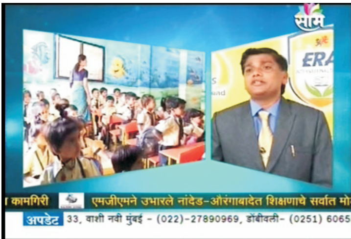
Samm TV (2015)