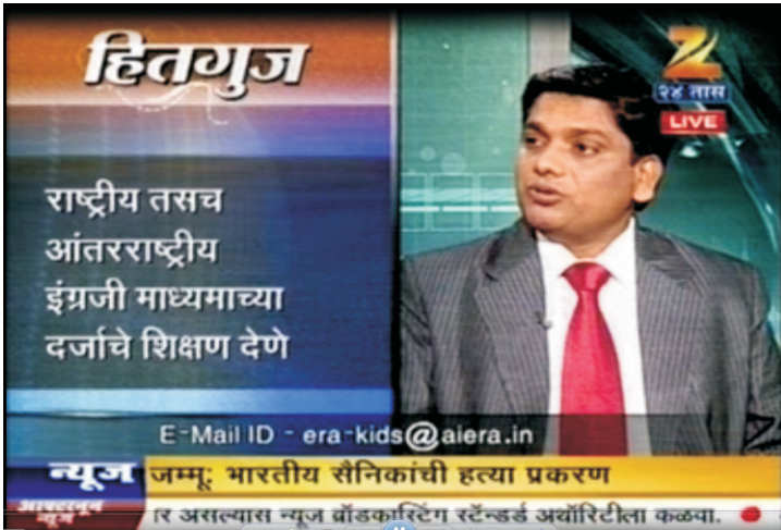
Zee 24 Tass - Hitguj (2014)