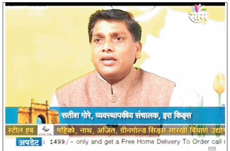
Samm TV (2017)