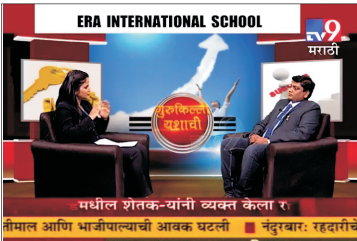
Tv9 Marathi (2017)