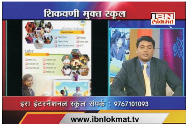
IBN Lokmat (2016)