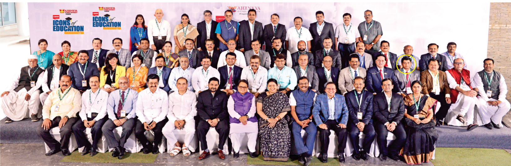
National Level Award By the Hand's of : Shri. Upendra Kushwaha Minister of State of Human Resource Development, (Govt. of India) Smt. Sharmilla Tagore