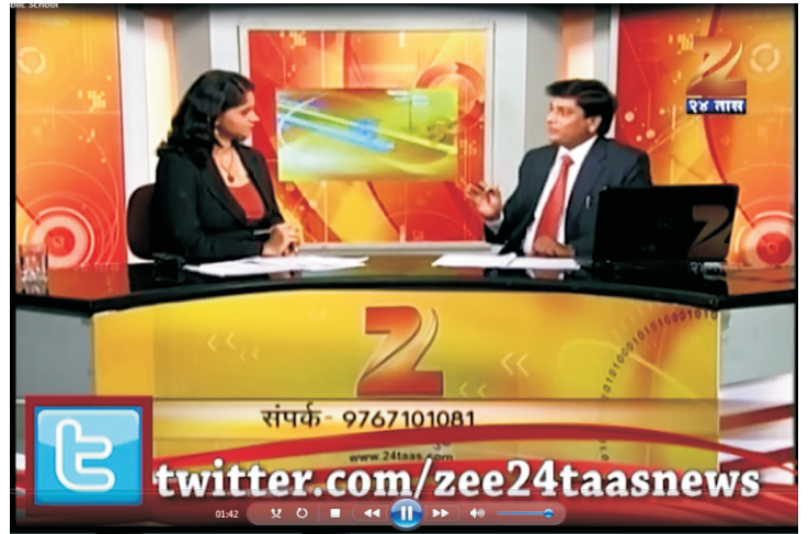
Zee 24 Tass - Hitguj (2015)